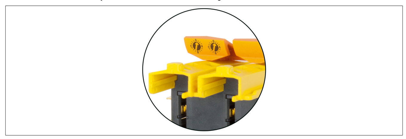
Figure 5: X20BMx6 - Node number switch identification

Symbols are printed on the locking lever of bus modules with node number switches. This provides a way to see from outside that the X20 system mounted in this slot is using node number switches.