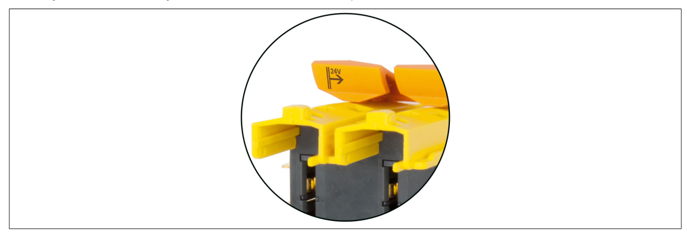
Figure 3: X20BM2x - Voltage routing identification

A symbol is printed on the locking lever on bus modules interrupted to the left. This makes it clear from the outside of a fully assembled X20 system that bus modules interrupted to the left are used in this slot.