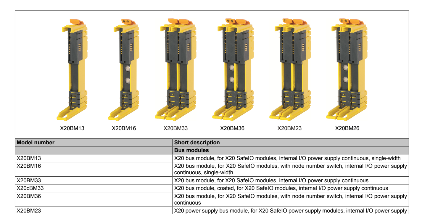
Table 1: X20BM13, X20BM16, X20BM33, X20cBM33, X20BM36, X20BM23, X20BM26 - Order data

internal I/O power supply interrupted to the left