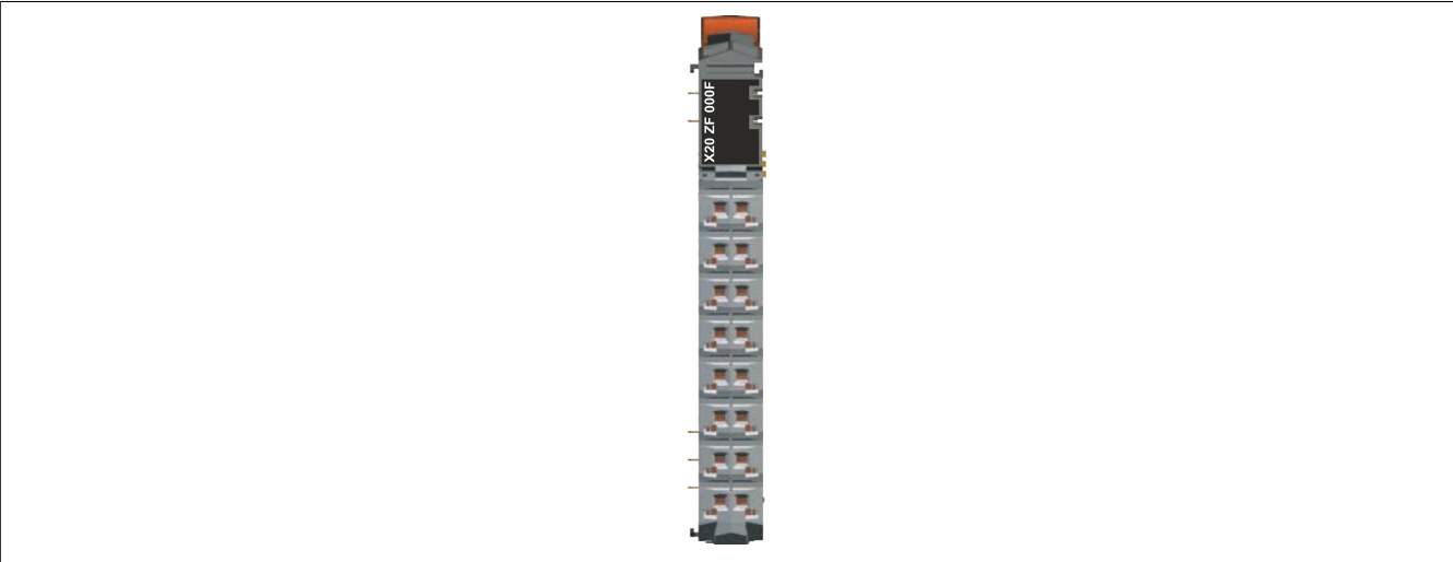
Table 2: X20ZF000F - Technical data