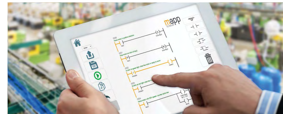
Web-based technologies eliminate the need for dedicated maintenance software

Industry 4.0 makes it possible to aggregate data from all sources (operational data, production scheduling, condition monitoring, historical data). Predictive asset analytics turn this