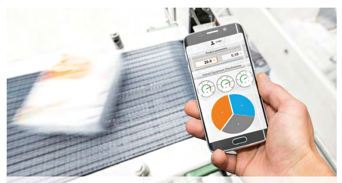
Industry 4.0 and the smart factory concept enable operational excellence

In many ways, the highly innovative packaging industry already operates according to these principles. Some filling and packaging lines are already producing products with personalized recipes (personalized medicine, custom-blended perfume) and customized containers.